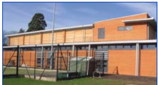
Sports Activity and Research Centre (SARC)

The new Sports Activity and Research Centre (SARC) opened in February 2003. It has an impressive competitive-sized sports hall, a well-equipped fitness gym, coaching rooms and an outside climbing wall. There is also an all weather pitch (for football, rugby, hockey, lacrosse and golf practice), an astro-pitch for hockey, netball courts, tennis courts and a cricket pitch. In the summer, an athletics track and a long-jump area are also available.