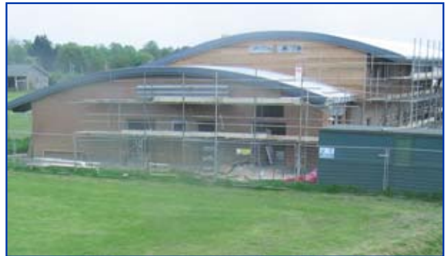
The new Students Union Building

The following picture shows that work is well advanced in building the new Students Union. This will provide a much needed social space for students including a bar and significantly enhance the student identity at UCC. The new Union replaces the Murray Hall which has benefited from an extensive refurbishment to create a performance space for drama and dance that will seat an audience of 200.